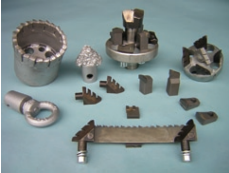
Photo shows root blades, carbide bits, tow ring and special swivel.